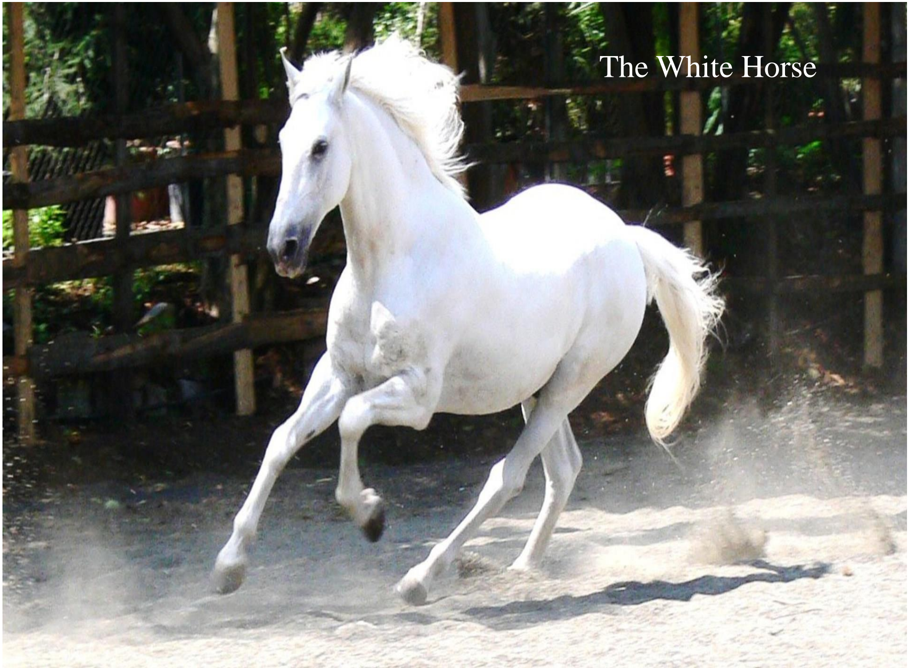
The White Horse